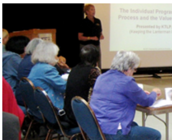
Workshop to help families access the services they need.