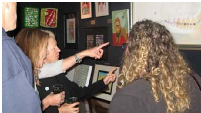
It's him! The white whale!

The Resource for People with Developmental Disabilities